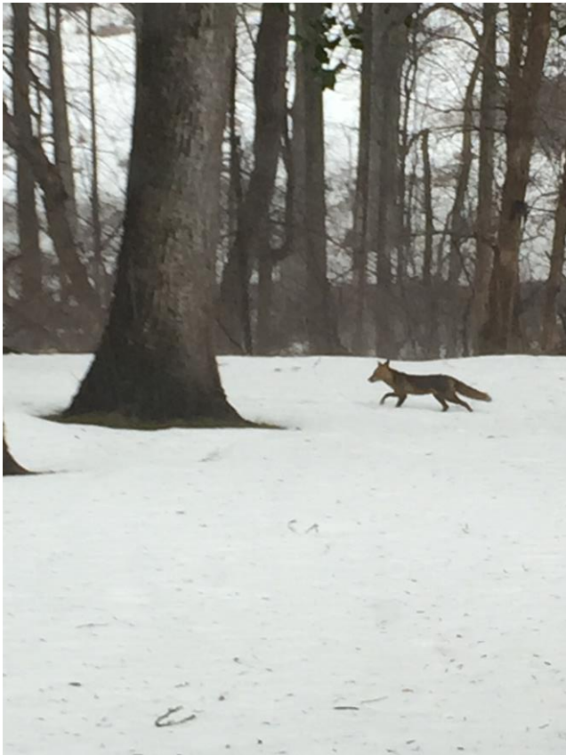
Brookeville's resident fox

Thank You to all Town Residents who lent a helping hand to their neighbors during and after this epic storm.