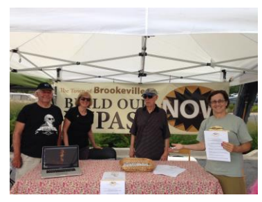
Team Brookeville under the tent

We had constant traffic to our tent-lots of people wanting information and to see