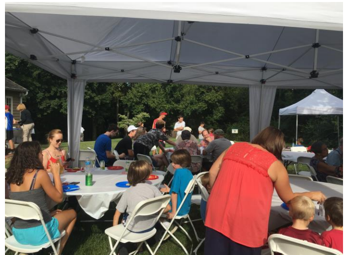
Picnic at the Academy Sept. 11, 2016

Please bring your favorite dish to share. Roast turkey, baked ham, soft drinks, beer, and wine. Babysitters and pizza for kids will be provided.