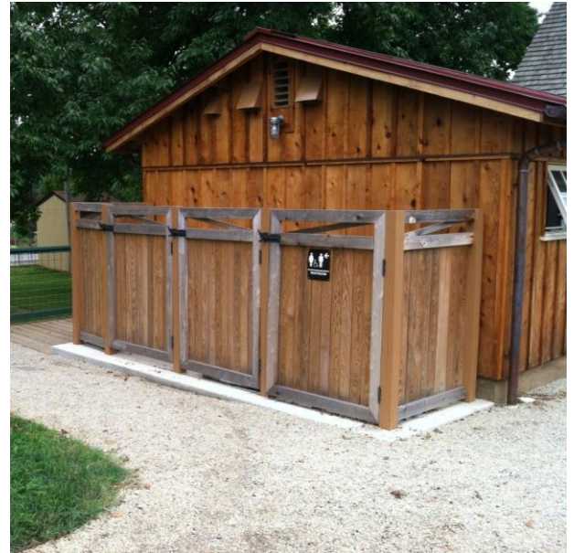
Figure 1 Proposed porta-potty enclosure

The Commissioners are scheduling conversations with Heritage Montgomery to develop a written agreement. Once more detailed information about the proposed use of the Schoolhouse is available, it will be shared with Town Residents.