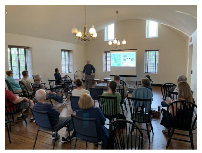
Public Meeting held on 6/22/2021

Lardner/Klein Landscape Architects hopes to have a final draft plan submitted to the Brookeville Planning Commission this summer at a public meeting.